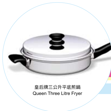
皇后牌三公升平底煎鍋 Queen Three Litre Fryer